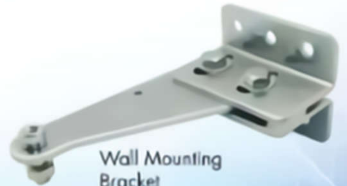
Wall Mounting Bracket