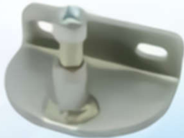
Gate Mounting Bracket