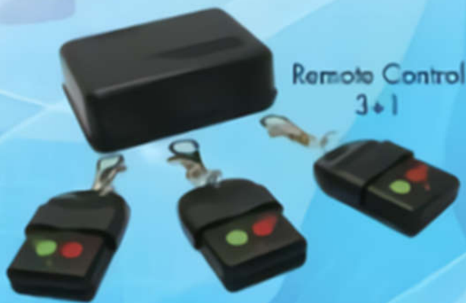
Remote Control 3+1